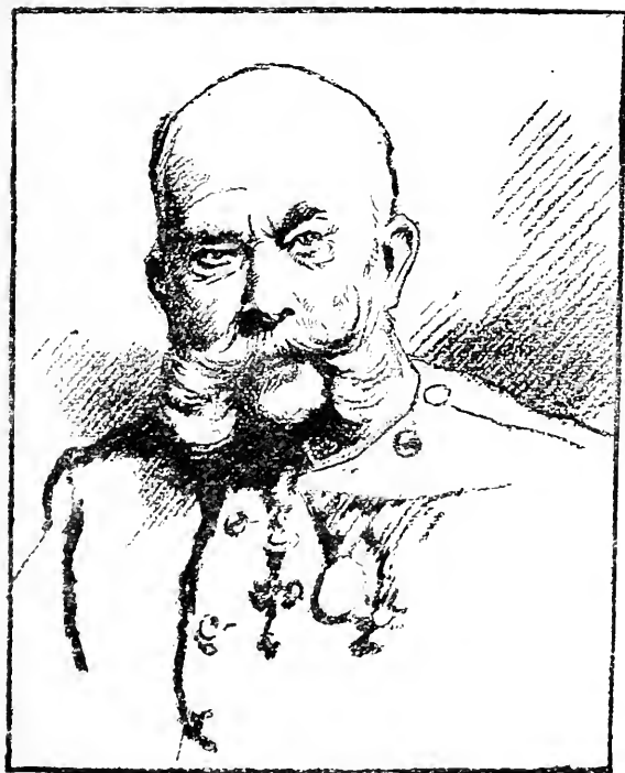
Francis Joseph, Emperor of Austria-Hungary